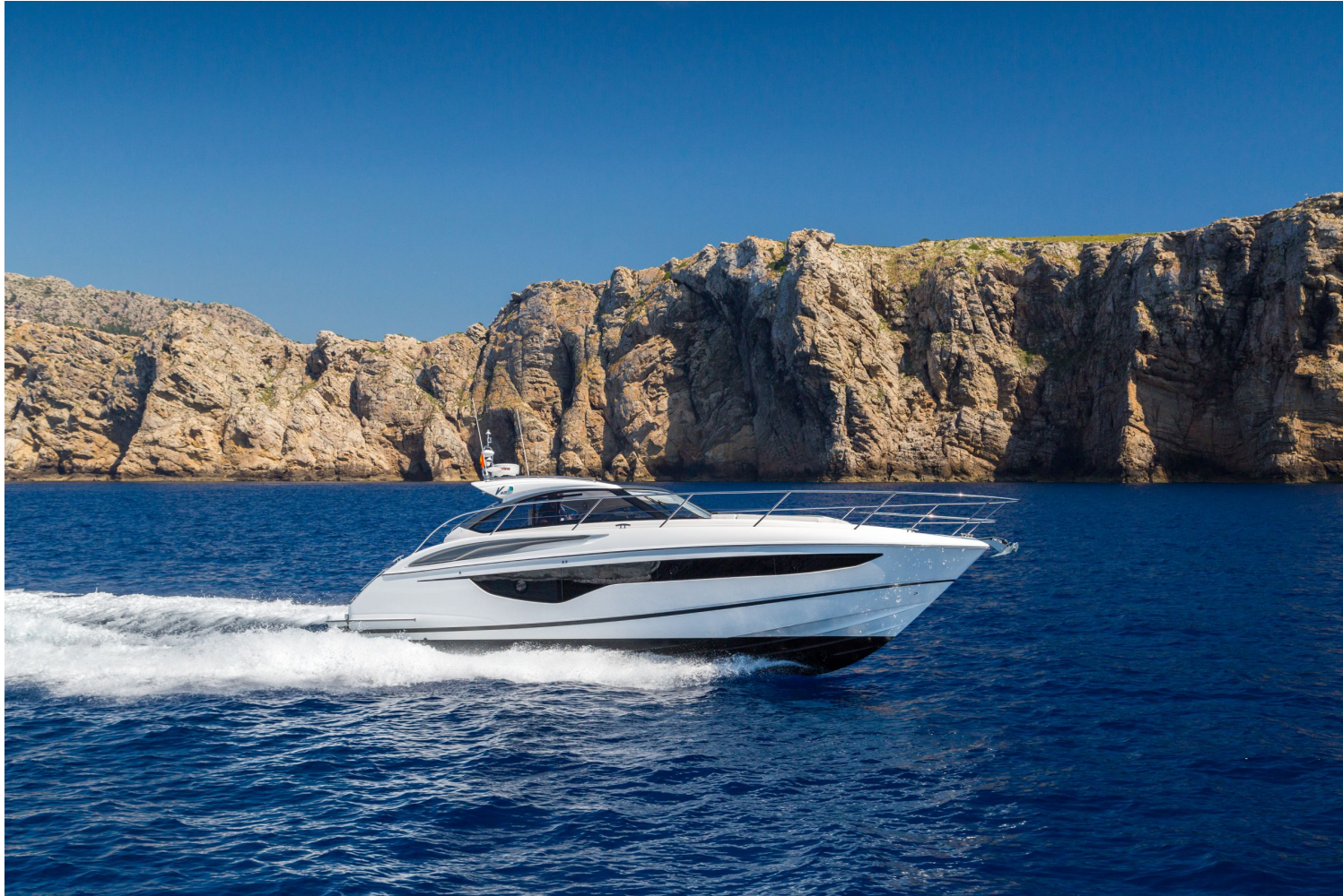
2023 PRINCESS V40